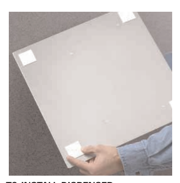
TO INSTALL DISPENSER USING METAL WALL PLATE